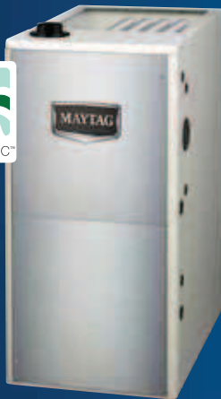
M1200 Upflow/Horizontal & Downflow