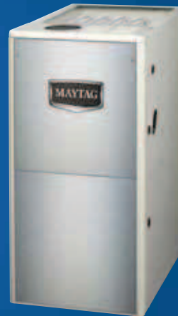
M1200 Upflow/Horizontal & Downflow

2-Stage 80% AFUE Variable Speed (M1200 Only) & Fixed Speed Gas Furnaces