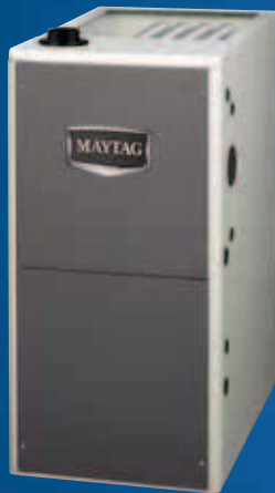
M120 Upflow/Horizontal & Downflow

2-Stage 80% AFUE Variable Speed (M1200 Only) & Fixed Speed Gas Furnaces