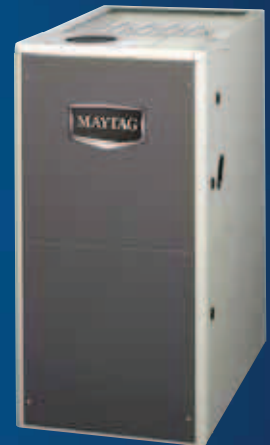
M120 Upflow/Horizontal & Downflow